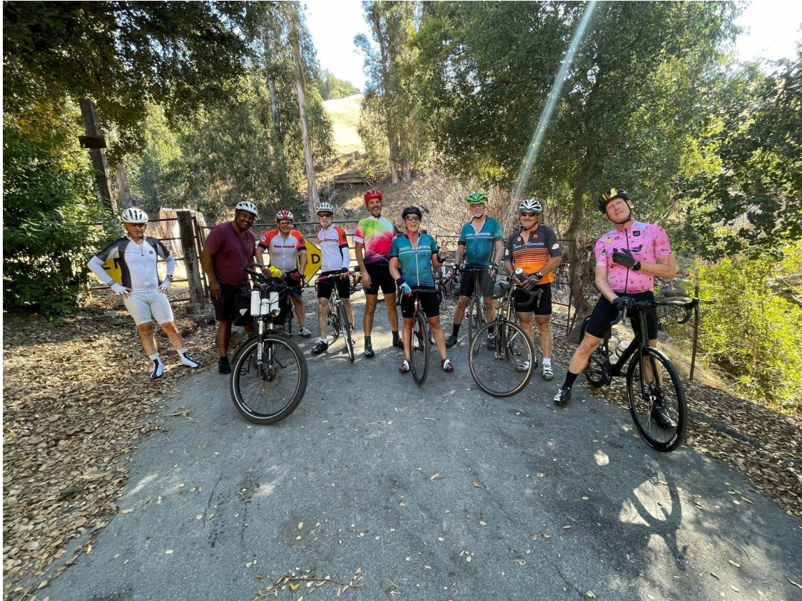
Eden Canyon - 29 September 2022 (when the weather was still warm)