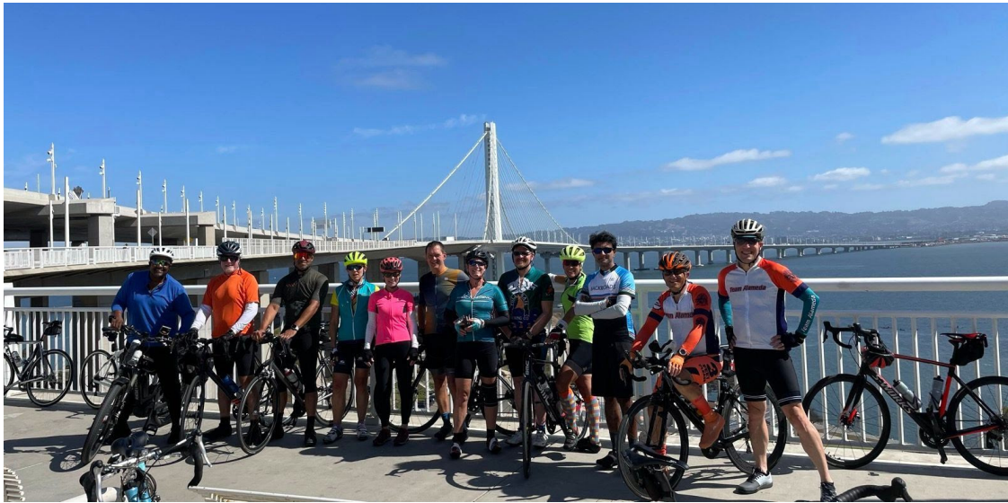
TA - Cycle Oregon (Street) - 17 September 2022