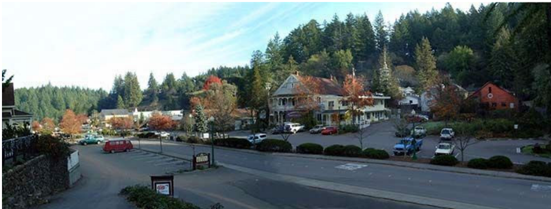
View from the Occidental Lodge

The first day, Friday, most people drove to Occidental and took part in a lovely ride along the Russian River and past the famed Bohemian Club . The total miles were relatively short, but that crew tackled some good climbs before making their way back to our “base camp” at the Occidental Lodge . A small group of three riders decided to ride their bikes up to Occidental – two of whom rode from the Richmond BART station (making their trip 72+ miles long); the third rode from Alameda (ending with a full 100 miles). After everyone checked in and cleaned up from their rides, we were greeted by one of our fabulous SAG team members, Martina Schniederger, who had set out a table and benches with beer, water, and snacks for everyone. We then walked through the weekly Occidental Farmers Market and took in some tunes from a local band playing at the market. Afterwards, we enjoyed dinner at a lovely restaurant called Hazel before heading back to the Lodge for a good night’s sleep.