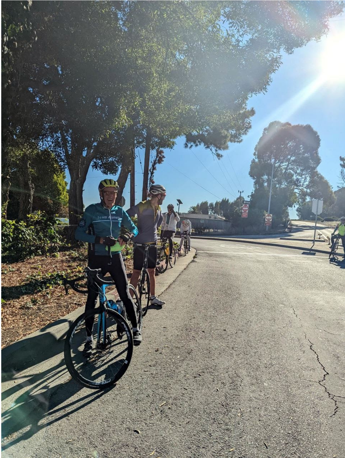
BART Millbrae-Peninsula Foothills-Dumbarton Bridge-Union City BART 19 November 2022