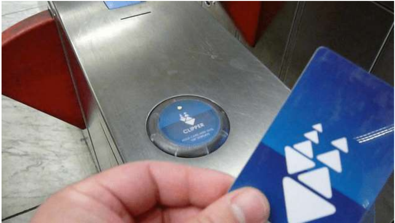
Clipper card and tag reader

public transport. You swipe the card at a tag reader and you are on your way! This card arrives fully functional, no additional verification is required.